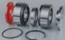
Wheel End Kits 41.01594